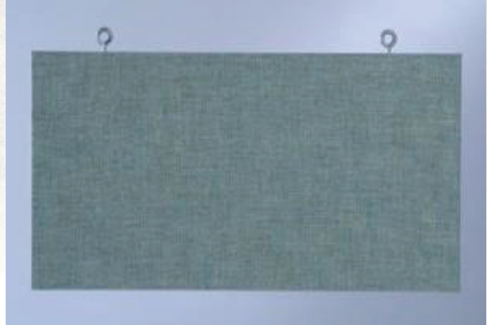
Absorption Plus Baffle Panel.

Additional product information at www.spi-co.com